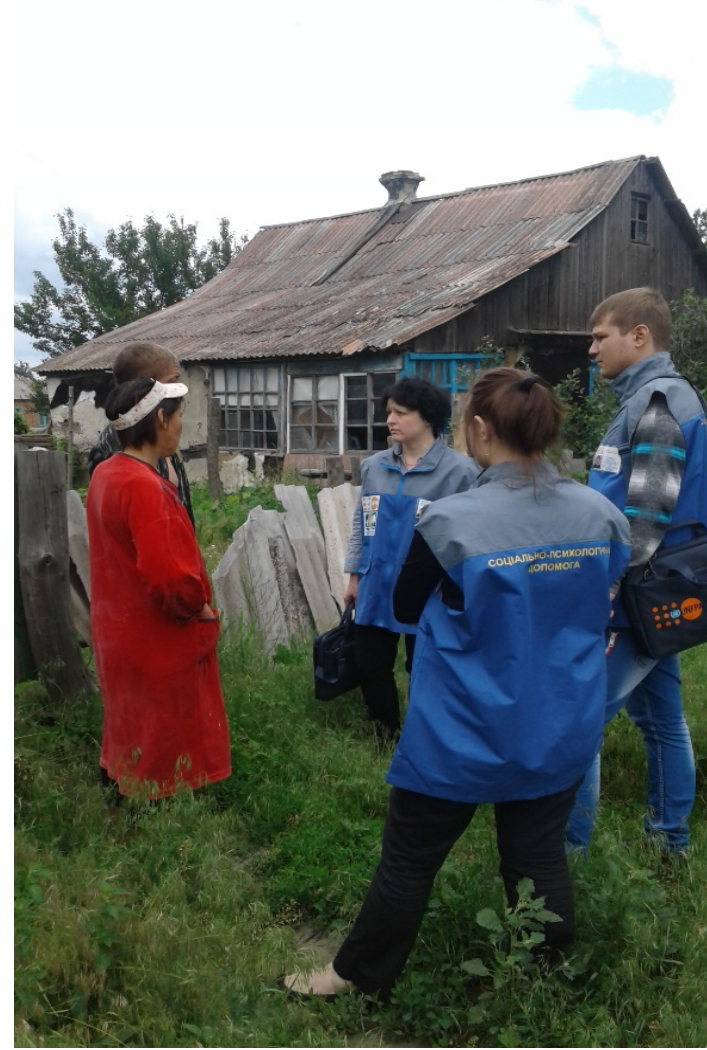
Outreach visit to conflict-affected communities of Donetsk region